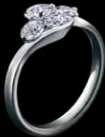
FOUR STONE CLUSTER RING 1ct