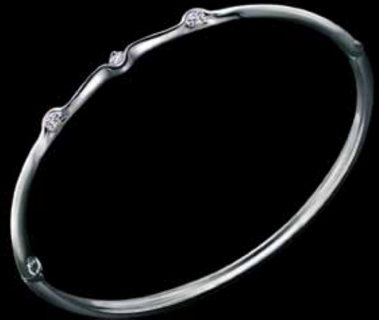
THREE STONE BANGLE 0.3ct