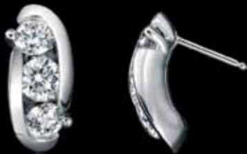
THREE STONE EARRINGS 0.66ct