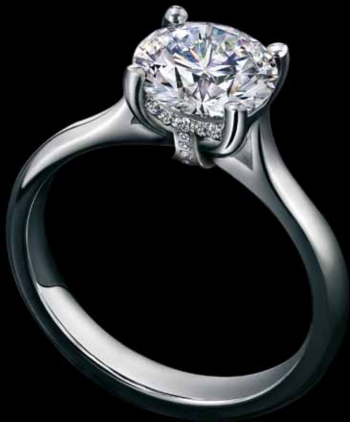
PAVÉ 'T' SOLITAIRE RING 1.5, 2, 3ct