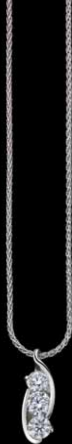
THREE STONE PENDANT 0.75ct