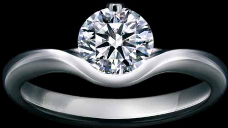
SOLITAIRE RING 0.33, 0.5, 0.75, 1ct