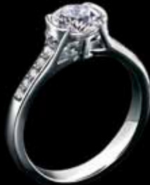
DEMI FLUSH SOLITAIRE PAVÉ SHOULDER RING 0.75, 1, 1.25, 1.5, 1.75ct