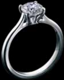
SOLITAIRE RING 0.5, 0.75, 1, 1.25ct