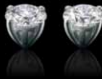
SOLITAIRE STUD EARRINGS 0.5, 1ct