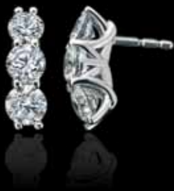
MULTISTONE EARRINGS 1ct