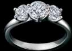
THREE STONE RING 1, 1.5ct