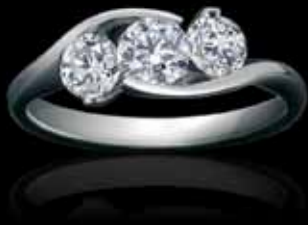
THREE STONE RING 0.7, 1ct